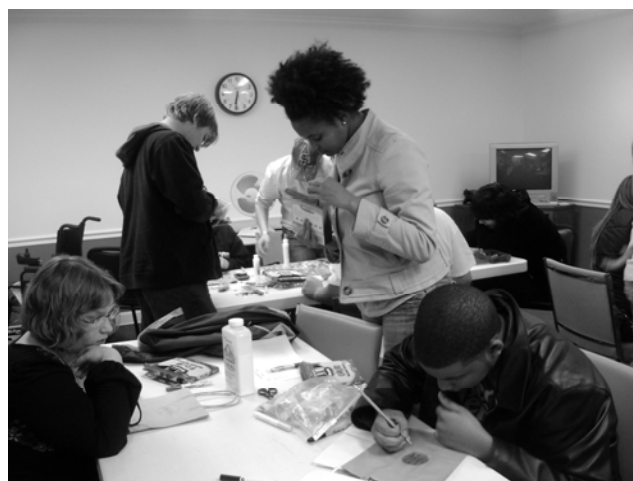
HS/HT students work with members of the Americorps to assemble hygiene kits for the Children's Home Society.

The students are now preparing for a much larger service project during Global Youth Service Week on April 24-26, 2009.